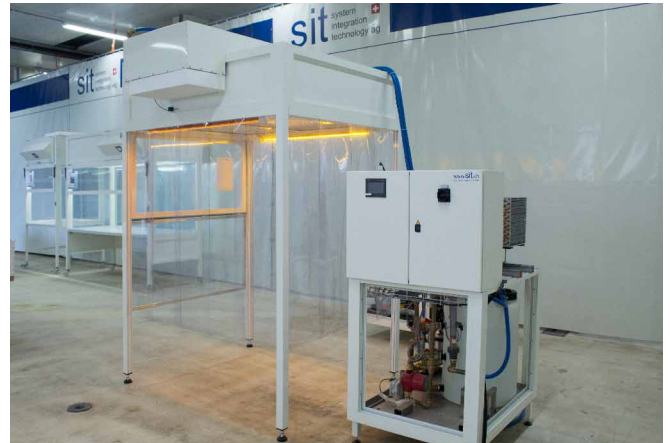
Fig. 1 clean room cell with strip curtain

Achievable cleanroom class on tabletop min ISO7, Class 10'000